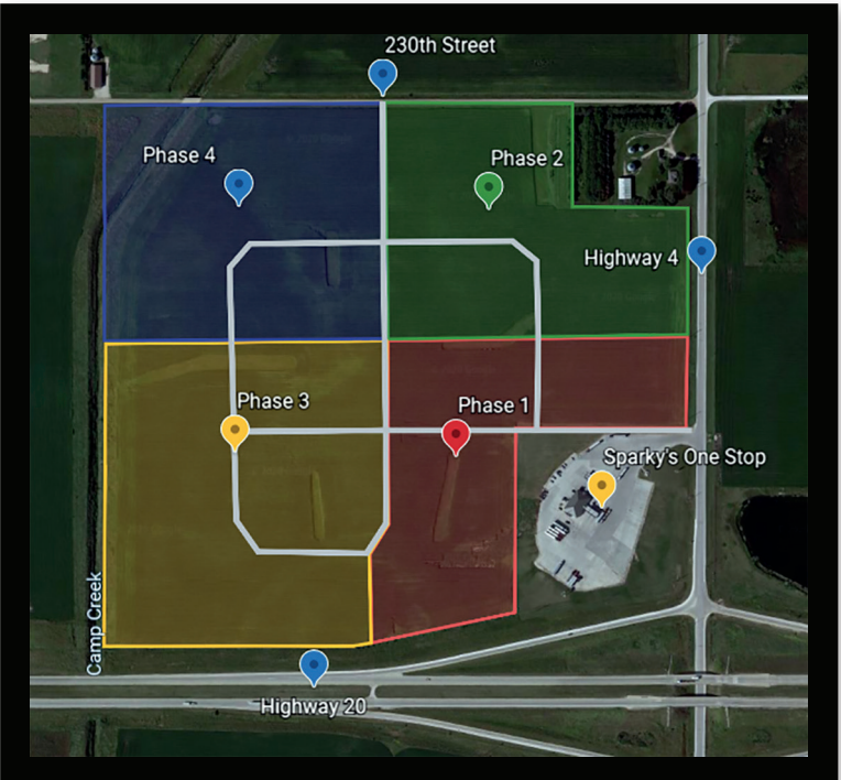
Above Calhoun County Rural Electric Cooperative's new business park, located at the intersection of Highway 20 and Highway 4, is a phased approach. Phase one, in red above, amounts to 21.72 acres. Groundbreaking is scheduled for late 2020 or early 2021. The park will help Calhoun County attract and retain businesses.

Why a business park? In short, it will help build Calhoun County's rural economy. However, it's more than that says Hildreth.